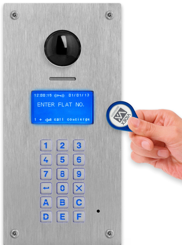
4215V/F flush installation