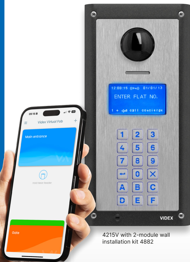
4215V with 2-module wall installation kit 4882