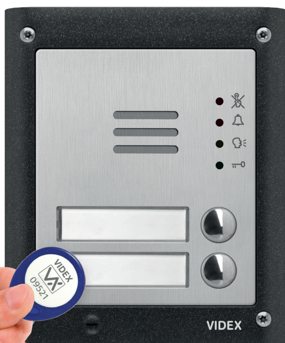
4504X-2/M with 1-module wall installation kit 4881