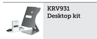
KRV931 Desktop kit