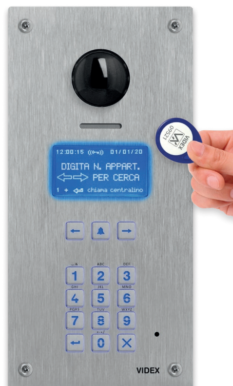
4312RV/F flush installation