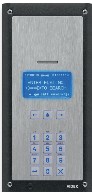
4312R with 2-module wall installation kit 4882