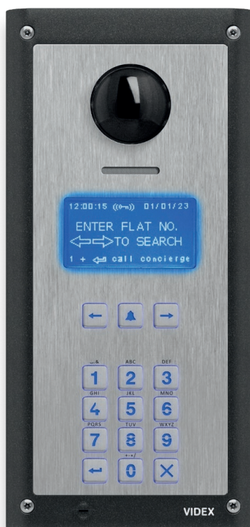
4312RV with 2-module wall installation kit 4882