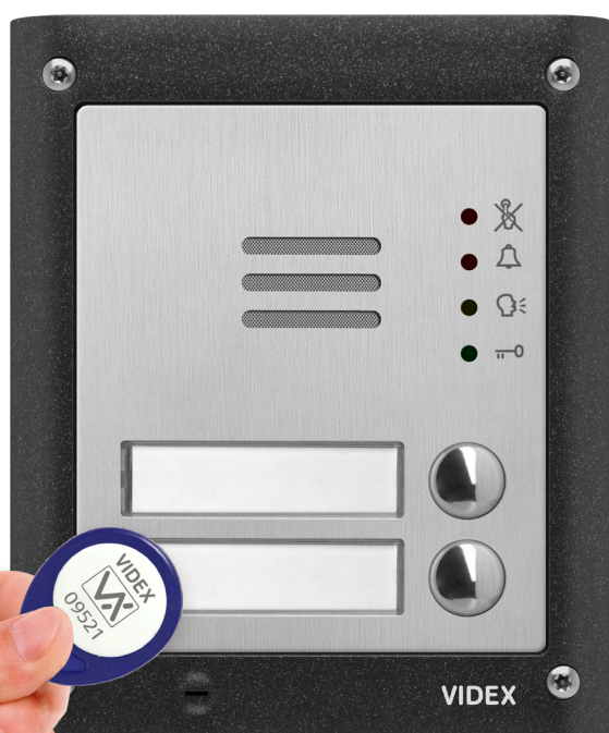
4505X-2/M with 1-module wall installation kit 4881