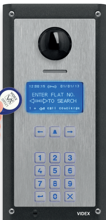
4514RV with 2-module wall installation kit 4882