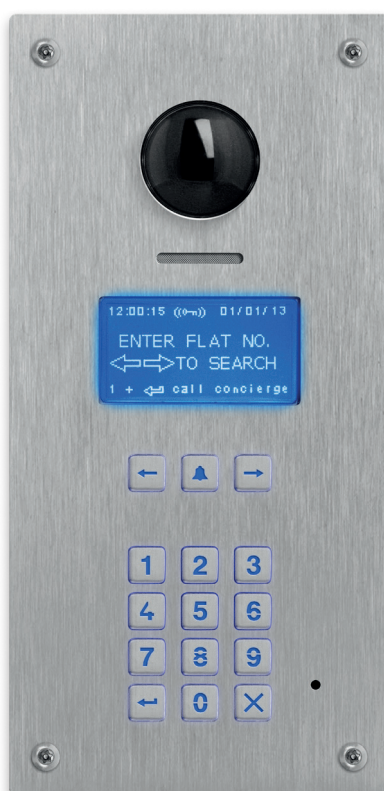
4514RV/F flush installation

The 4000 series digital call panel is uniquely compact compared to the rest of the market, occupying only 2 modules.