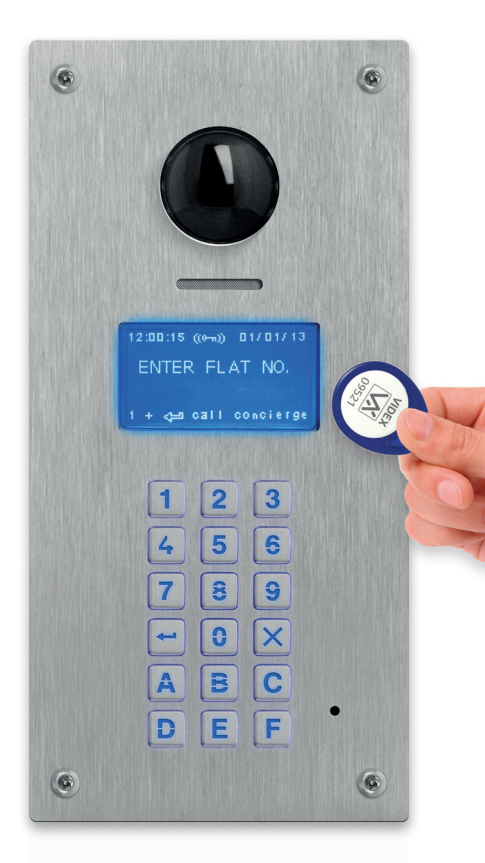
4514V/F flush installation

The 4000 series digital call panel is uniquely compact compared to the rest of the market, occupying only 2 modules.