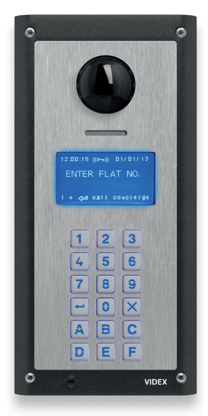
4514V with 2-module wall installation kit 4882

Thanks to SIP protocol support, Art.4514 can be connected to phones and VOIP switchboards, while standard RTSP protocol allows to transmit the video stream towards compatible devices.