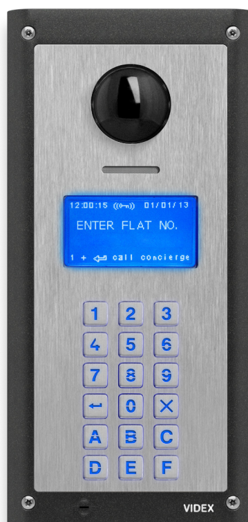
4515V with 2-module wall installation kit 4882

Thanks to SIP protocol support, Art.4515 can be connected to phones and VOIP switchboards, while standard RTSP protocol allows to transmit the video stream towards compatible devices.