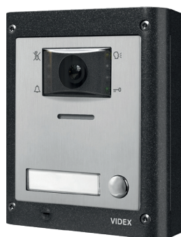
1 module 4881 installation example

Wall installation kit for 4000 series digital call station