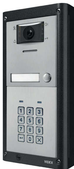
2 modules 4882 installation example