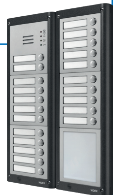
6 modules 4886 installation example