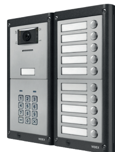
4 modules 4884 installation example