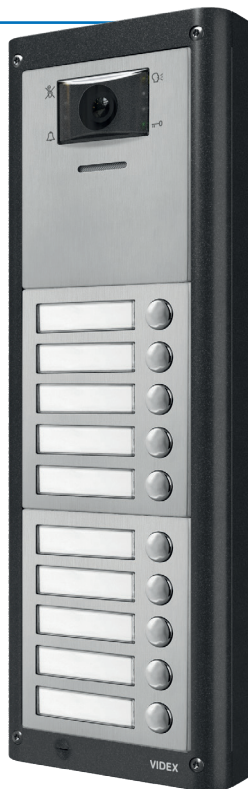
3 modules 4883 installation example