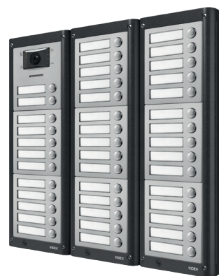
9 modules 4889 installation example

Also available in Aluminium painted finish