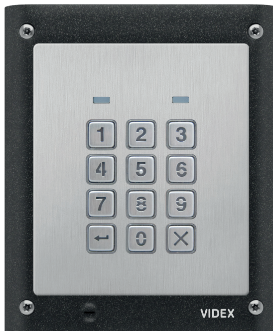
4903/M with 1-module wall installation kit 4881