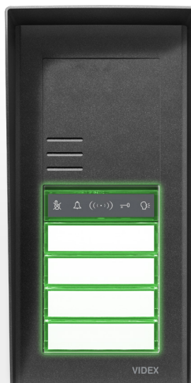
4 buttons (shown with ERARSB rainshield)