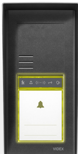
1 button (shown with ERARSB rainshield)